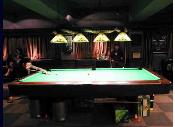
IN AND OUT: Joe's Billiards & Bar (above); Vibes (below).

Woolloomooloo Prime , 21/F The One, 100 Nathan Road, tel: 2870 0087