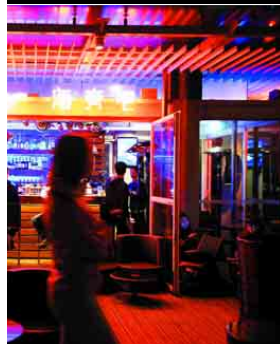
EASTERN PROMISE: the jazz band at Ned Kelly's Last Stand (main image); Deck N Beer (left).

Castro's , 16 Ashley Road, tel: 2957 8041 Ned Kelly's Last Stand , 11A Ashley Road, tel: 2376 0562 Ashley 23 , 23-25 Ashley Road