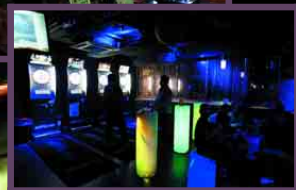
SWILL TIME: Castro's (top); and fun and games at A's (above) in Ashley 23.